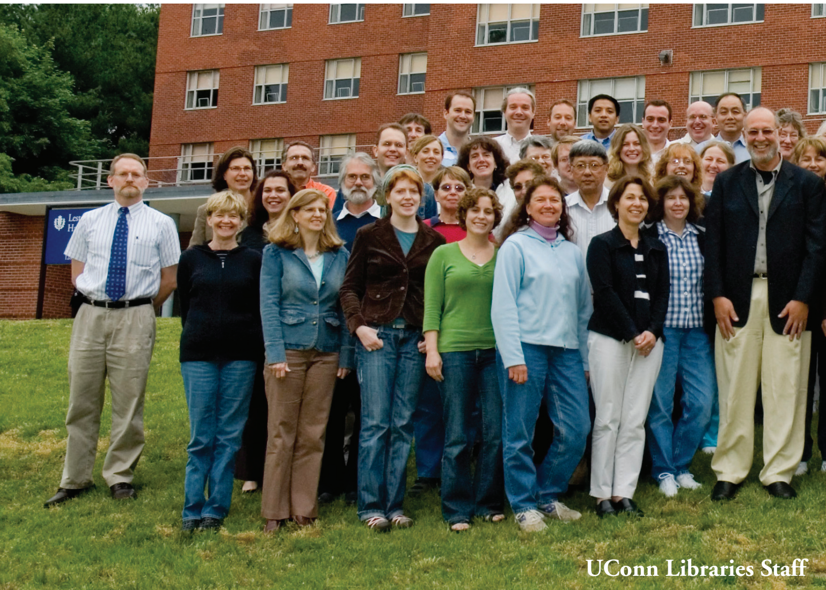
UConn Libraries Staff