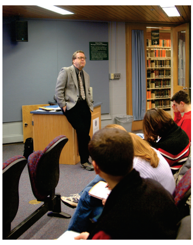
(Top) The newly renovated Waterbury Library. (Bottom) Video Theatre One in Homer Babbidge Library.