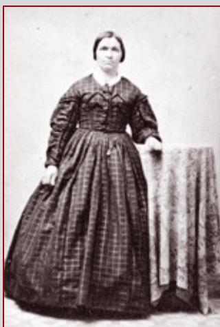
A Civil War nurse