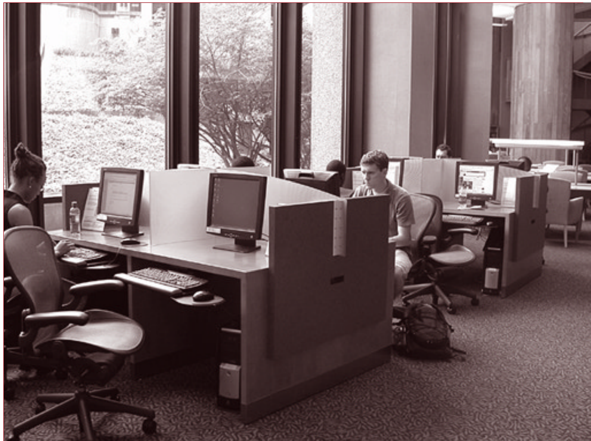
Renovated study area in the UConn Health Center Library

The two computer classrooms, previously defined with