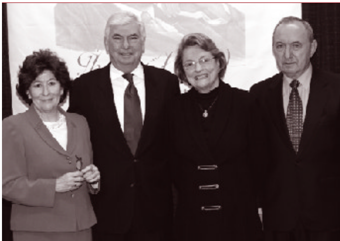
Human rights advocates Louise Arbour (left) and Richard J. Goldstone (far right), shown here with Senator Christopher Dodd and former Congresswoman Barbara Kennelly, received the 2005 Thomas J. Dodd Prize in International Justice and Human Rights in a ceremony on October 17.

Some 300 people gathered on the plaza of the Thomas J. Dodd Research Center on October 17 to honor two attorneys for their roles in advancing international justice.